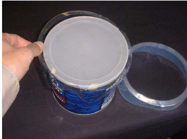
Preforms are placed manually over your product